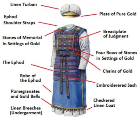
Ephod on the High Priest