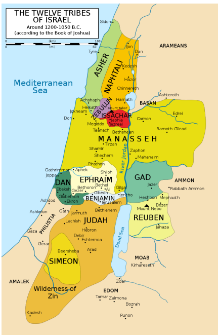
Philistia's Location Facilitated Frequent Attacks